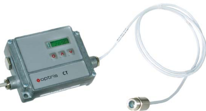
Picture 3: Miniaturised sensor head and electronic box of infrared thermometer optris CT LT

Modern production technology not only enabled price reductions within the production process, it also established the multiple uses of infrared thermometers within equipment. The miniaturised infrared thermometers op-