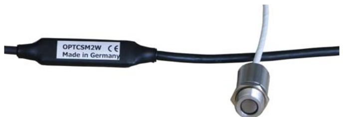
The smallest and most robust sensor within the technology of non-contact temperature measurement; developed and produced by Optris.

We have a large network of distributors all over the world to ensure worldwide sales of our products as well as fast and qualified regional customer services. It is of great importance for us that all of our distributors have very good knowledge regarding our products and therefore, they receive regular product training.