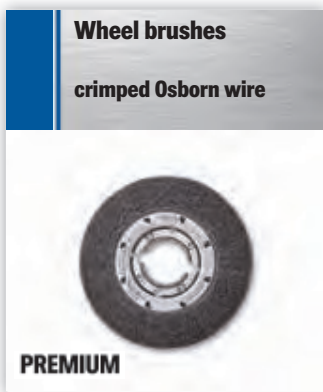
Wheel brushes crimped Osborn wire